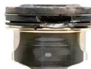
Piston head after 10,000 miles Damage from LSPI

Super Pro Max Engine Oils provides exceptional protection and keeps engines cleaner for extended drain intervals in all operating environments.