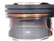
Piston head after 45,000 miles SuperPro Max protecting from LSPI